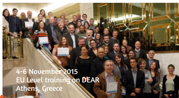
4-6 November 2015 EU Level training on DEAR Athens, Greece

Culture is a considerable and a major element to communicate and raise awareness. In this sense, the project LADDER foresees the development of a professional theatre play as a channel to communicate development issues by reaching the public and the citizens through the universal language of art, music and theatre. The purpose is, indeed, to inspire citizens, raise their awareness and to inform them on development challenges via culture. The performances are foreseen to take place during the implementation period in different countries of the project.