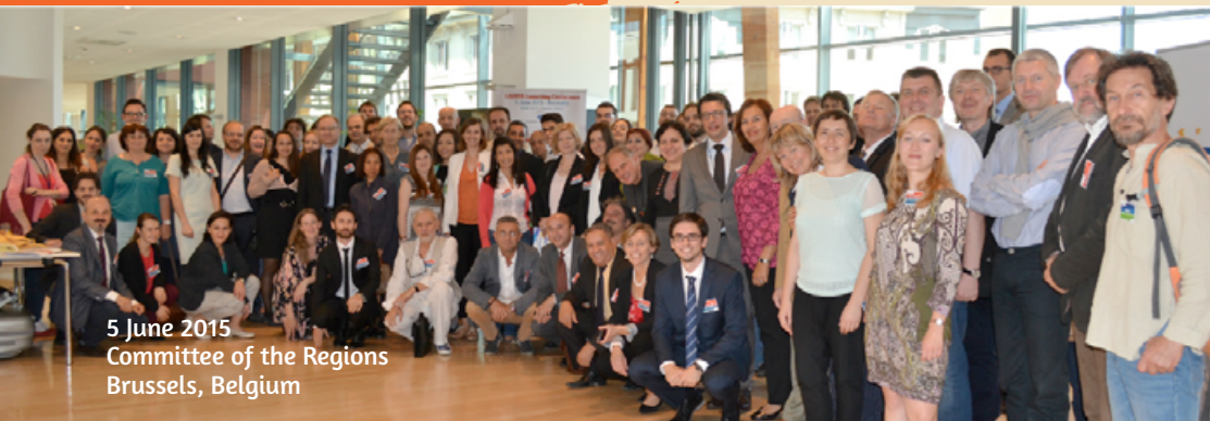
5 June 2015 Committee of the Regions Brussels, Belgium

LADDER is a 3-year project co-funded by the EU under the DEAR programme. It aims at enhancing the action of Local Authorities for Development Education and Awareness Raising (see “ Background Information - What is DEAR? ” section) in the EU and in the ‘enlarged Europe’ (accession countries and European Neighbourhood area).