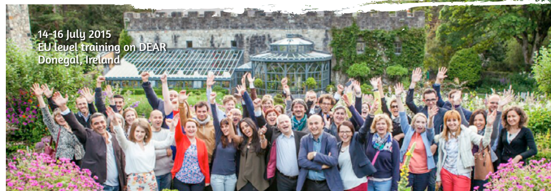
14-16 July 2015 EU level training on DEAR Donegal, Ireland

The second grass-root initiative is the Citizens Journalists Initiative. The target group is motivated citizen journalists (non-professional), who report and write on development topics such as poverty eradication, development, education, etc. An informal network of citizen journalists will be created across the countries covered by the project to promote the role of individuals, and the private and public sector in global development issues with local implications. To conclude, both the citizen journalists initiative and the Slogan Competition will contribute to communicate the project’s approach and raise awareness on development issues in a way which is appealing for the ordinary citizens. These initiatives are foreseen in all countries of the consortium.