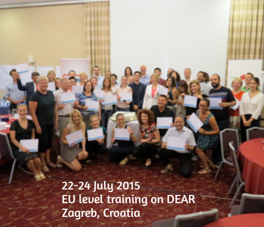
22-24 July 2015 EU level training on DEAR Zagreb, Croatia