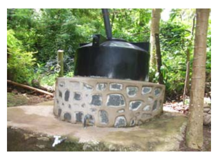
Rain-water Harvesting on Tea Estate