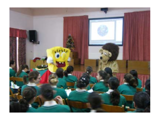
Animators acting out the Water for Life-Malta roleplay during school presentations.

Various activities are planned for 2009. SOS Malta shall continue delivering these school presentations in the first quarter of 2009. In view of complementing the school presentations, SOS Malta also plans to organise an art competition for school children aged 11-14 years, focused on the theme of the Water for Life-Malta project. The work of art which will win the art competition will be used as the image for a 2010 calendar which will be distributed among public, corporate and NGO stakeholders in Malta. A facebook account called Water for Life-Malta , set up in November 2008, will be used as a communications tool during the rest of the project's implementation, generating public awareness about Malta's Overseas Development Assistance and development obligations, whilst relating the latter also to the discourse of water poverty. A fund-raising campaign is also being planned for the second quarter of 2009, in view of financing rainwater harvesting projects in developing countries. The Water for Life-Malta project will end in September 2009.