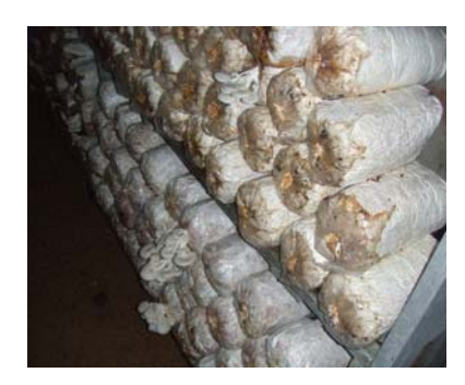
Cultivation of Mushrooms

Equipment was purchased and seed money donated to the Matara Parish to carry out the necessary alterations to an area of St Mary's Convent School to be used as a Life Long Learning Centre and small social enterprises.. Unemployed women were trained and equipped with the necessary skills to work and earn a decent wage. The results of these initiatives was excellent and showed a marked improvement in the quality of life of all the women who were empowered to take on new responsibilities and increase of knowledge.