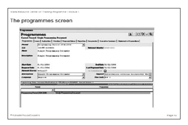
Figure 4 - An example of the static slides used to explain the Structural Funds Database to participants.

implementation of projects financed by Structural Funds. An explanation of the overriding principles and rules of public procurement was given, with reference to the Public Contracts Regulations 2005<sup>14</sup>, the latter implementing Directive 2004/18/EC.