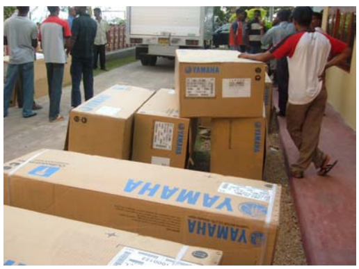
Engines for Boats