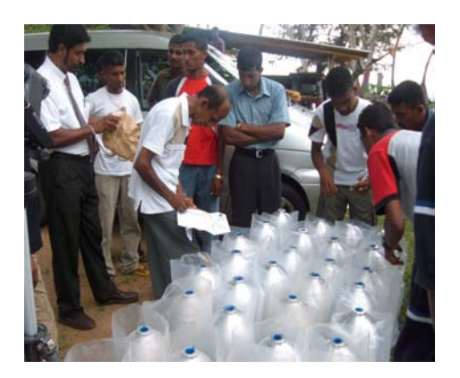
Cylinders for the Dive Centres

this money would then go towards funding other projects and providing more aid. It also gave us some assurance that the fishermen were indeed using the boats.