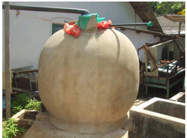
Domestic RWH Water Tank